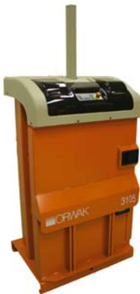
The smallest front loaded baler in the assortment

An autostart function allows the baler to start compacting the material as soon as you close the door.